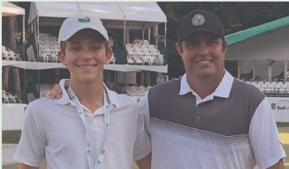
John Deere Classic